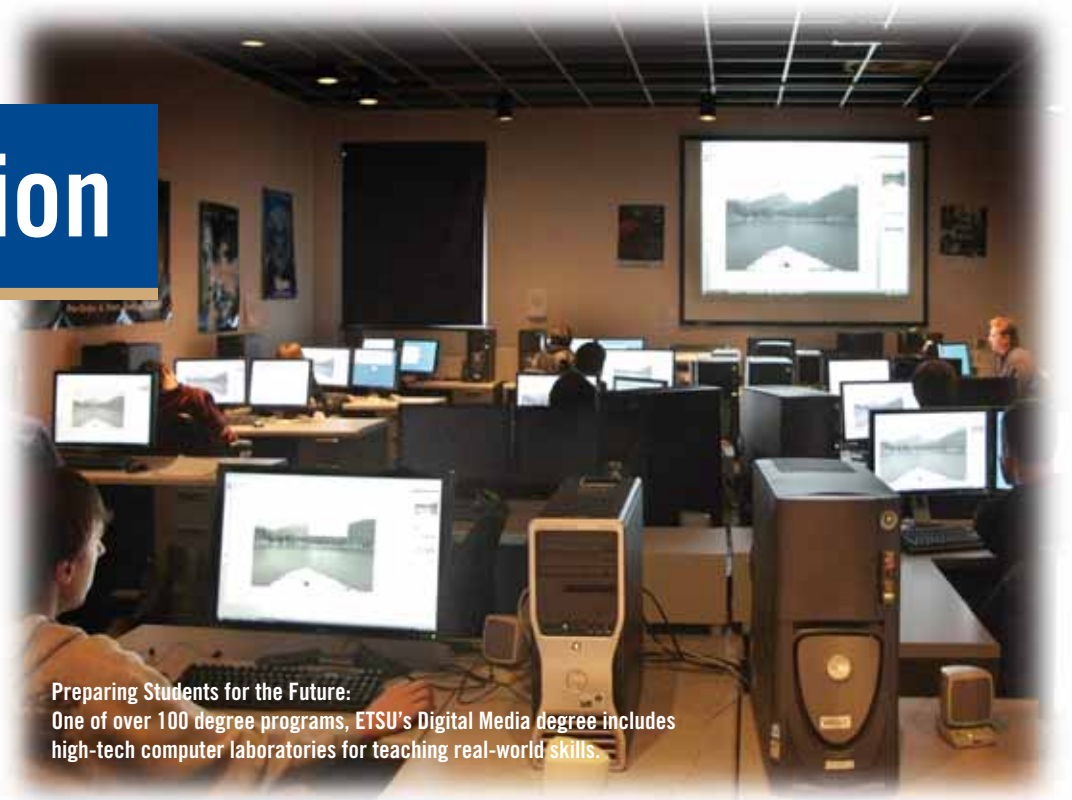
Preparing Students for the Future: One of over 100 degree programs, ETSU's Digital Media degree includes high-tech computer laboratories for teaching real-world skills.

Nearing its 100th year, East Tennessee State University began as a small teachers' college but has grown into a major university of over 14,000 students. ETSU now prepares students for 21st century careers with advanced studies in medicine and various tech-based disciplines. Just as ETSU changed with the times, Citizens Bank added locations, services and technologies to meet the financial needs of people right here in the Tri-Cities region. Citizens Bank has a 75-year tradition of banking excellence ... giving you the resources and flexibility to "Bank Your Own Way!"