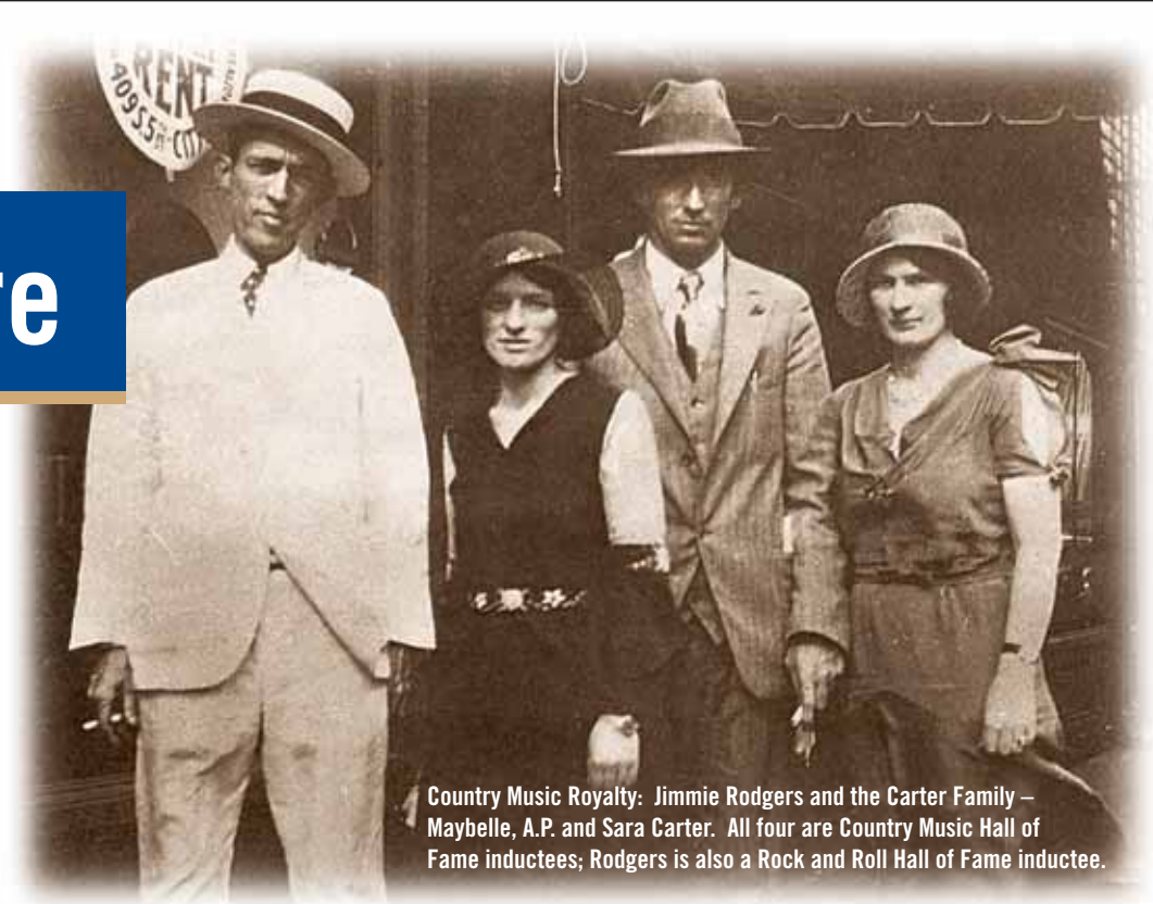
Country Music Royalty: Jimmie Rodgers and the Carter Family – Maybelle, A.P. and Sara Carter. All four are Country Music Hall of Fame inductees; Rodgers is also a Rock and Roll Hall of Fame inductee.